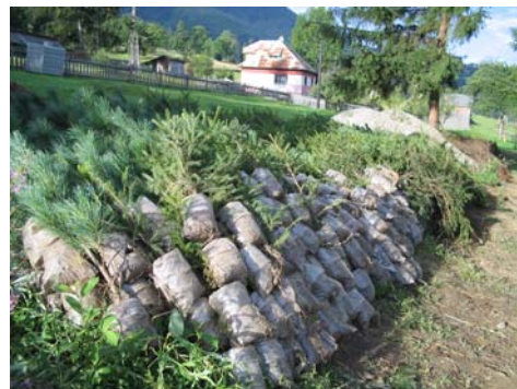
Seedling deposited in Borsa

From the Sinaia Nursery, the seedlings were transported to Borsa (intermediate deposit) and then to Pietrosul