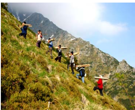
Carrying sticks on the back

• The place of the seedling beds distributed all over the 50 hectares were marked by using the previously mentioned sticks.