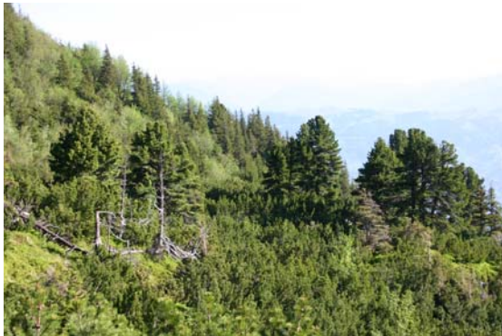
Cembra and mugo pines associated with spruce

It should be stressed that survey took into account not only woody vegetation but all environmental conditions in which it develops, such as: geology, geomorphology, and hydrographic factors.