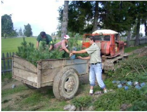
Seedling transportation to Pietrosul