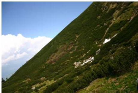
Well conserved dwarf pine