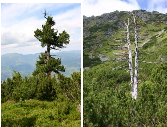
Degraded cembra pine population that must be reintroduced

The cembra pine is naturally distributed in Austrian, Swiss, French and Italian Alps Mountains between 1 200 and 2 500 m elevation. It also occurs in Romanian, Polish, Ukrainian and Slovak Carpathian Mts. In Romania, the species has its altitudinal span between 1 400 m and 2 000 m growing mixed with dwarf pine and spruce. Cembra pine is important for many reasons like for reforestation of the sub alpine zone, furniture, handicrafts, landscaping, etc. It grows together with spruce and dwarf pine. Among the three woody species from Pietrosul, the cembra pine was the most destroyed, so that, today less than 40 over-aged trees have survived.