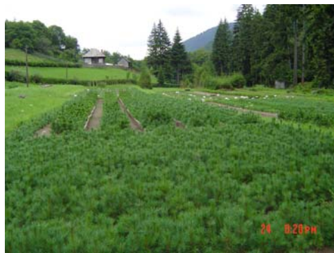
Seedlings in the Sinaia nursery prior transportation

All seedlings were produced by the ICAS as beneficiary / partner at its Sinaia Nursery located at about 700 m elevation.