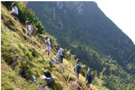
Seedling charring on the back, a hard work

By using wood baskets, the potted seedlings were carried on their back by the workers to the planting beds. Because of the basket weight (about 30 kg) and sloppy land and wild vegetation, this work was very hard and difficult. For transportation 12350 potted seedlings, about 400 up and down runs took place.