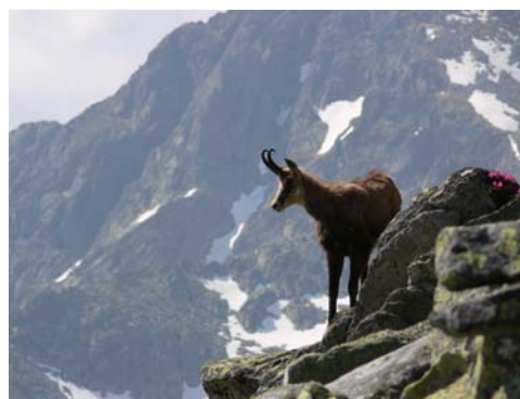
Black goat must be protected

squirrel) or very small (mice). Some species like wolf, lynx, and brown bear, wild cat require strict protection, and they are included in the Red List. In the past, the illegal hunting caused serious damages in wildlife, but at present there is a guard team who is limiting the destructive actions on the whole National Park, including the project LIFE planted area.