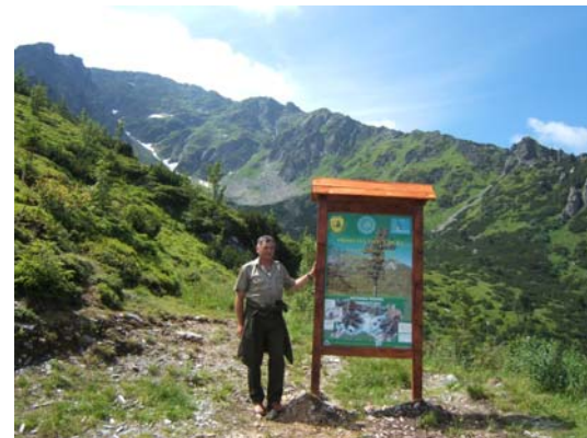
Panel installed in the project area